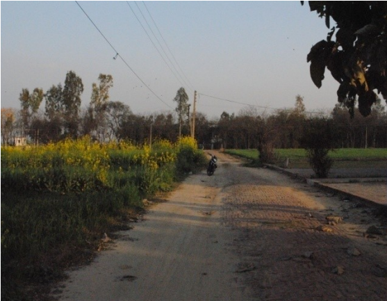
Project site: Entrance from Road