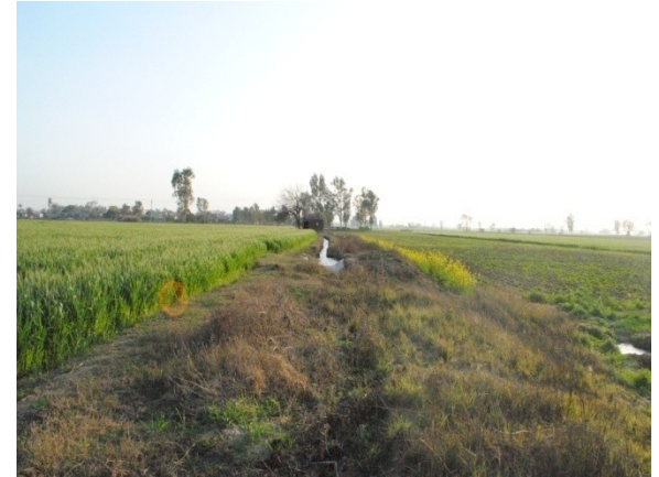
Project Site: Irrigation Channel