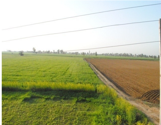
Project site: Land towards Canal